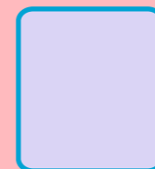
OM SAI RMO