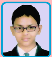
OM SUBHAM INO